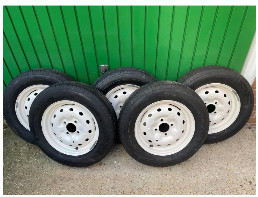
The MGA wheels fully refurbished for Rufus.

As for the wheels; measuring the axle revealed that the original donor was a steel wheeled car. In any event Cracker has the wider axle that was standard with steel wheels. Recently I sent the five 15" MGA wheels I had previously bought from NG Cars to 'Alloy Tech' (a local wheel restorer) and had them blasted and finished in RAL 9001 Cream powder coat, they are destined for Rufus the TA and they now look superb. My ultimate plan is to change Cracker's wire wheels for my favoured steel wheels from an MGA or TR6, buying new wheel rims from Rimmer Bros.