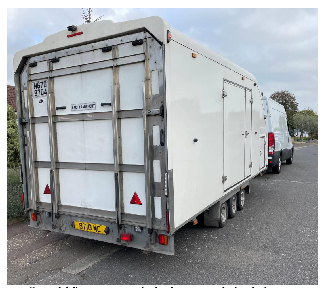
Covered delivery was expensive but he was snug during the journey.

stops (a lay-by near Beverley). Early the next morning we travelled to Filey. After spending the day there we travelled to Great Barugh (near Malton) in the late afternoon, met up with Mark (for the umpteenth time) viewed the car and within ten seconds had shaken hands on the deal. I was now the very proud owner of a TC who I quickly named 'The Cream Cracker' ('Cracker' for short) who was delivered four days later.