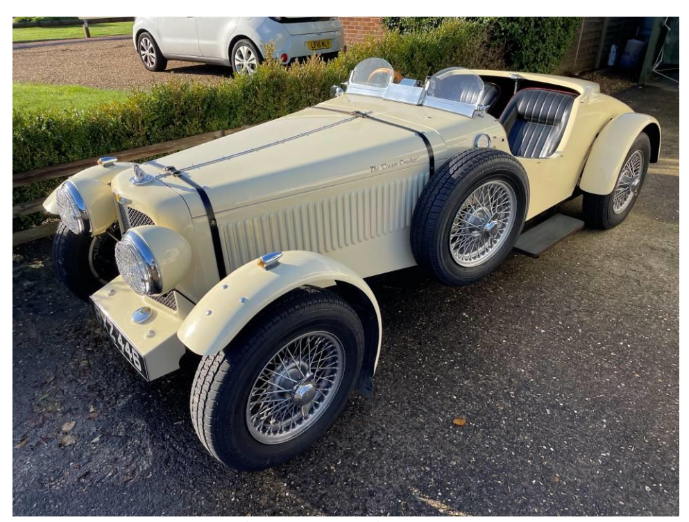
Cracker as he is today.

To summarise, if he wasn't so good (and I was a few years younger) I would have no hesitation in pulling Cracker apart and doing a concours rebuild incorporating a bespoke wiring loom; as it is I am confining my activities to small adjustments and sympathetic modifications so he better suits me.